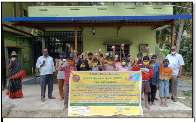
"COVID Awareness and distribution of biscuits to children"

This children center is started with a objective of providing free education to rural children through sustainable agriculture. The children center is support by ASHA for Education, Seattle . The center is ensuring educational support to 26 children who had educational gap due to various reasons and also children from economical poor backward families. An importance is also given to nurture systematic daily routine, educational progressive activities, extra & Co-curriculum initiatives, and additional skill based education like basic