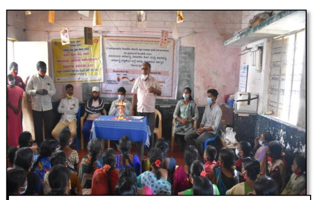
"Free Community Health check up camp at Bislere"

The "Sustainable project titled resource conservation management and improved livelihood for marginalized indigenous communities" was started in August 2021 and is successfully being implemented in 25 backward villages of Kadur block, Chikamagalur district with the financial support from Karl Kübel Stiftung (KKS/BMZ) Germany. Around 2795 Low income families are being benefiting from the project intervention.