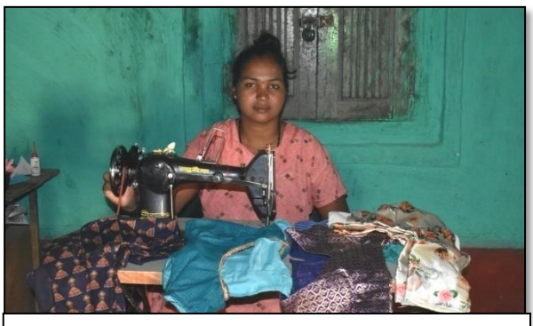
"Tailoring – Self employment after four months free Tailoring training"

To sustain the rural livelihood and to ensure self employment habits among the rural communities, VIKASANA has been supporting and encouraging towards income generation and entrepreneurship management activities for 1245 poor and low income families living in 25 backward villages of Kadur block, 26 villages in Koppa and Sringeri and 10 villages in Tarikere block. Through this intervention of Vikasana many families are earning an additional income in their family which is contributing to the financial