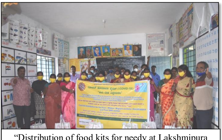
"Distribution of food kits for needy at Lakshmipura Village"

3. COVID -19 relief activities - KKS Germany, PPI Seattle and Asha for Education, Seattle: