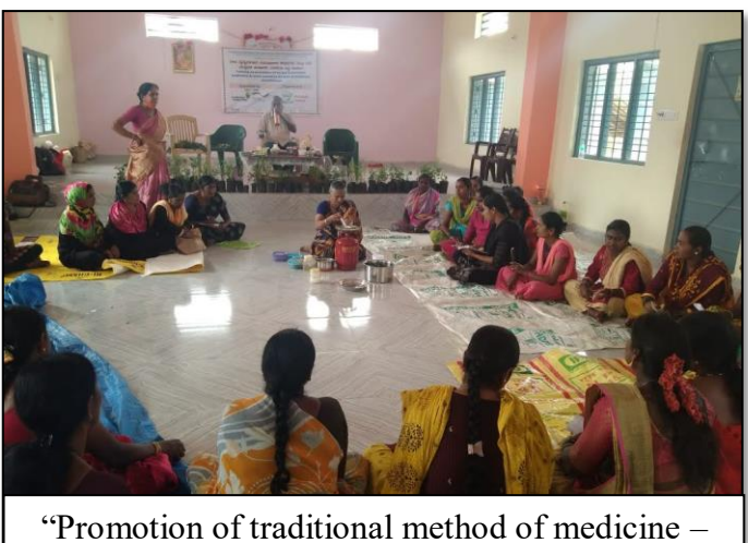
"Promotion of traditional method of medicine – Training Programme at V Yaradakere"

Vikasana has been promoting herbal medicines and encouraging the traditional medicines among the communities. We still extended our efforts to encourage the practices of traditional/herbal medicines to control dependency on high cost English medicines in project villages. The key activities such as awareness generation, exhibition on herbal medicine, identification of local Nativaidyaru medicinal (Traditional doctors) and services were benefited to 150 people from KKS supported Food security