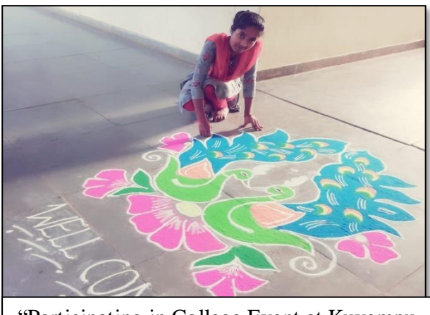
"Participating in College Event at Kuvempu University"